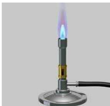
Figure 1.12 Burner.