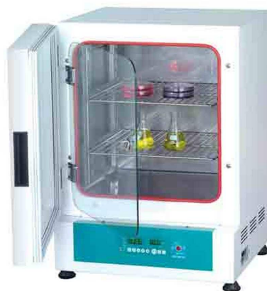
Figure 1.16 Incubator.