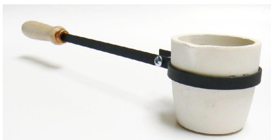
Figure 1.13 Crucible.

Crucibles are used to contain the sample while it is being heated on a burner.