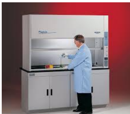
Figure 1.17 Fume Hood.

A fume hood is a device that vents potentially dangerous or noxious fumes created by certain chemicals or chemical reactions from the laboratory to the outside atmosphere.