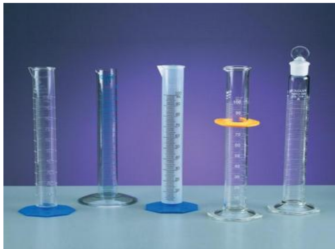
Figure 1.2 Graduated Cylinders.