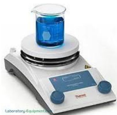
Figure 1.14 Hot Plate.