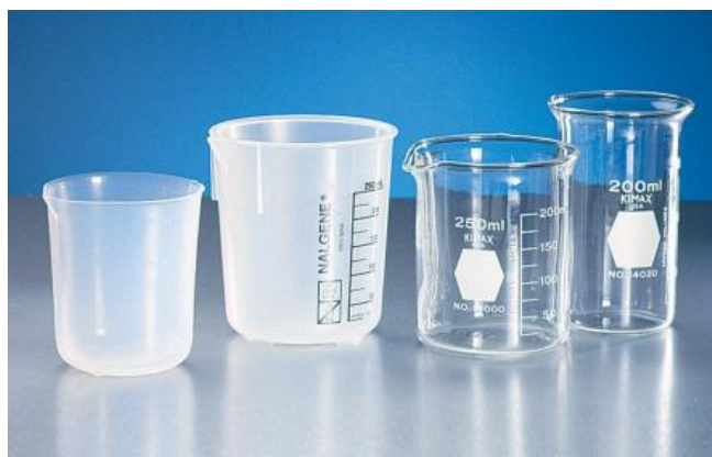
Figure 1.1 Beakers.