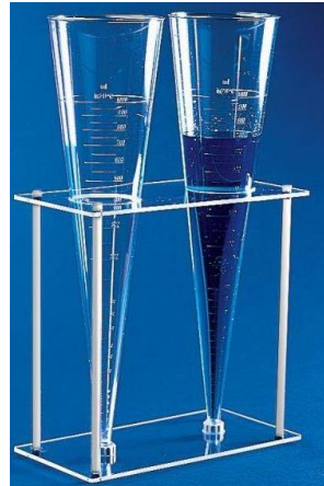
Figure 1.9 Imhoff Cone.