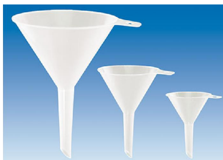
Figure 1.7 Funnels.