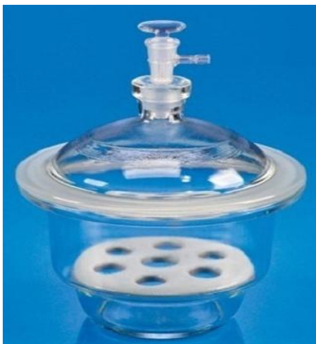
Figure 1.15 Desiccator.

Typically, a sample is heated in an oven to dry it and then placed in the desiccator to cool prior to weighing or undergoing further preparation.