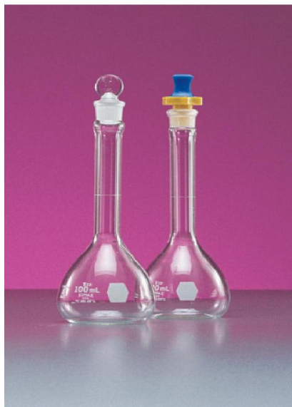
Figure 1.5 Volumetric Flasks.

Another common type of flask is a volumetric flask, which is made to contain a very precise amount of chemical. Volumetric flasks are usually used to prepare standard solutions.