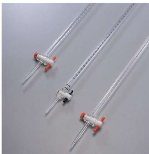
Figure 1.4 Burets.