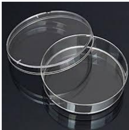
Figure 1.11 Petri Dish.

Petri dishes are used primarily for bacterial analyses. They are available in a variety of sizes and can have either a loose or tight fitting lid.