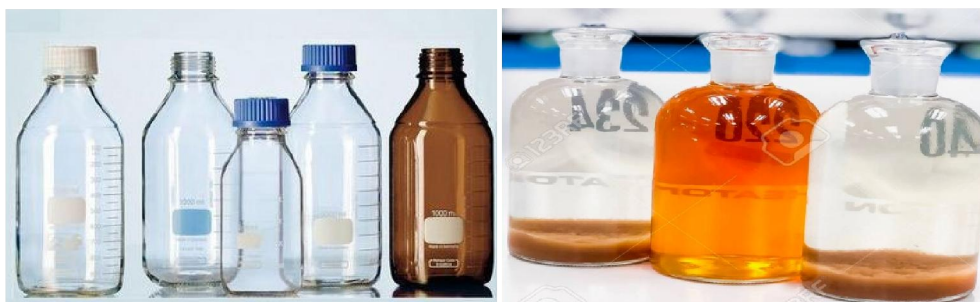
Figure 1.6 Laboratory Glass Bottles ( left), BOD bottles ( Right).