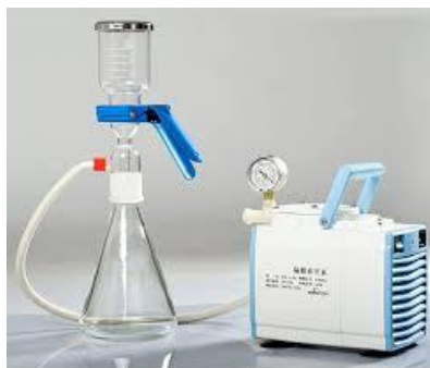
Figure 1.18 Vacuum pump.

Vacuum pumps are typically used during the filtration of samples prior to analysis.