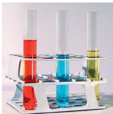
Figure 1.8 Test tubes.